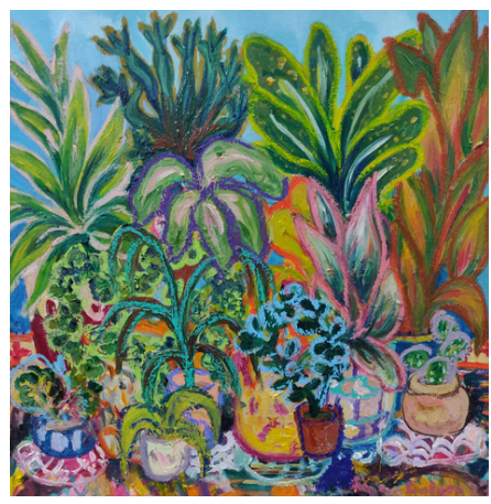
Plants on Doillies, Oils on canvas, 40x40cm, 2023