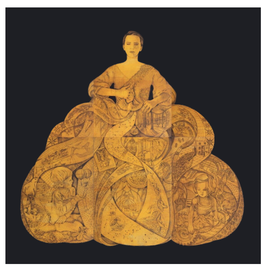
All the Rivers that Flow through Me, 6 Etching Panel, 170 x 170cm, Limited edition of 18, 2019