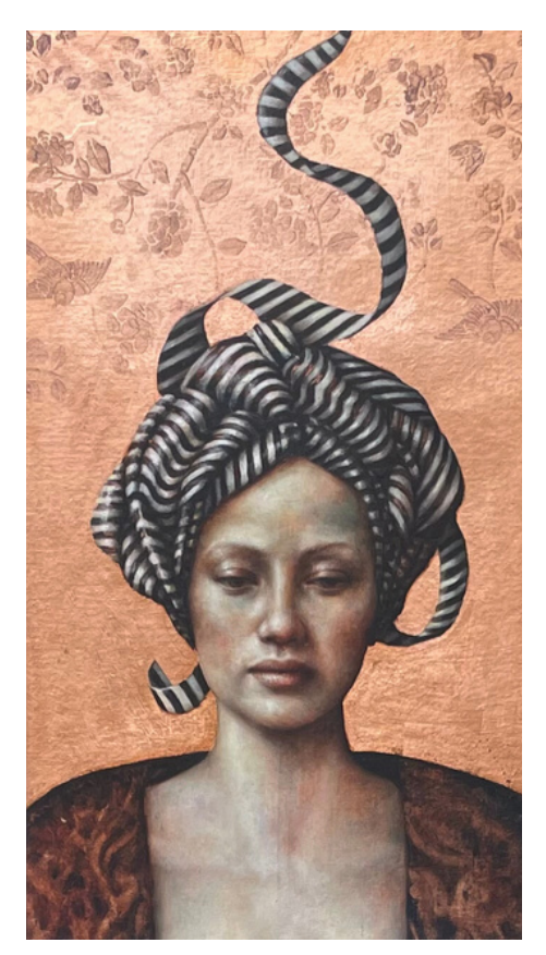
Nursemaid, Oil on copperleaf, 82×48 cm, 2017