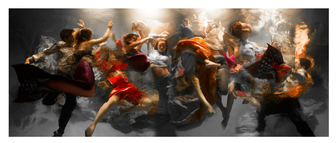
Love Live, Giclee print on Canson Museum Rag, face-mounting114.2x295cm,Editions of 5, 2018