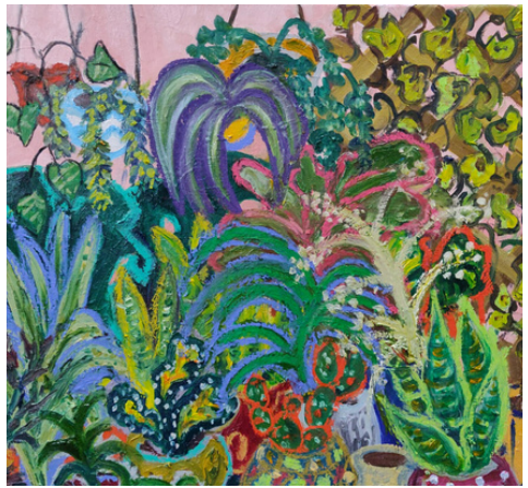
Indoor Garden, Oils on canvas, 40x40cm 2023