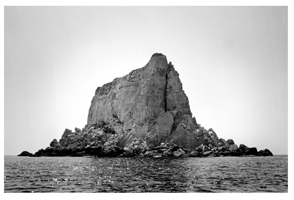
Filfla, Analogue. Printed on hahnemuhle archival paper, 83x55 inches, Edition of 10,2023

Whilst creating this image in 2006, Amelia Troubridge was reflecting on the importance of being in solitude with the natural surroundings. She sought to capture the all-powerful and mysterious nature of the land and the sea.