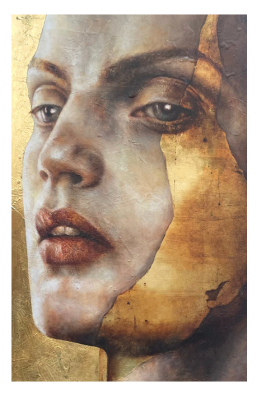
Nothing is Ever Broken, Mixed Media on Canvas 110 × 63 cm, 2018