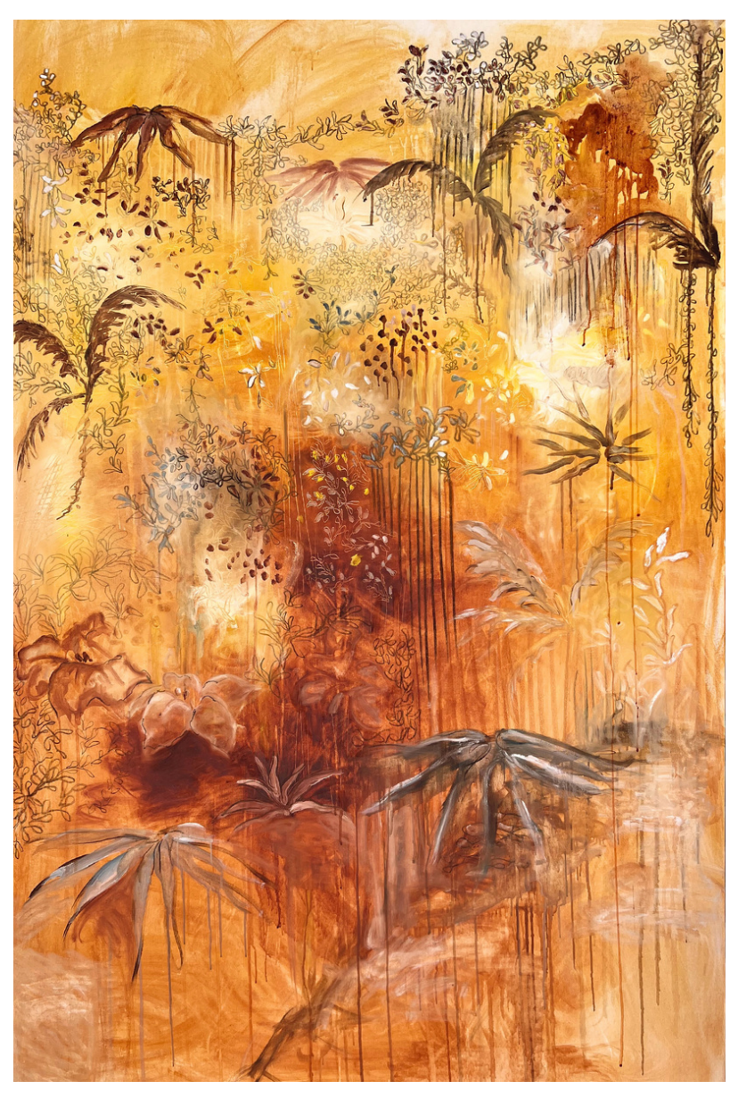
'Shades of', Mixed media, 180x120cm,2023