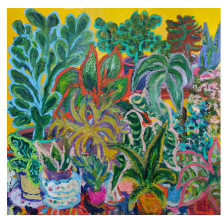
Townhouse Courtyard, Oils on canvas, 40x40cm, 2023

Belonging to the ongoing Plants and Gardens series, these artworks initially embarked on an exploration of our biophilic response, both experienced tangibly and through the surge of virtual greenery in our lives during the tumultuous year of 2020. These works underscore the intrinsic value of domestic green spaces as sanctuaries, inviting individuals to retreat, introspect, and restore their equilibrium, thus endorsing an enduring sense of tranquility. As socially engaged pieces, these paintings raise pertinent questions about the gradual erosion of public green spaces and the encroachment of urban development on our islands. They serve as a profound reminder of the fragile sustainability of our natural environment and the crucial imperative for a revitalised connection with nature in an increasingly digitised world. In essence, these exclusive artworks for Gracey's Series transcend conventional boundaries, compelling viewers to contemplate the significance of our natural surroundings, the sanctity of personal retreat, and the urgency to nurture and protect our shared environment.